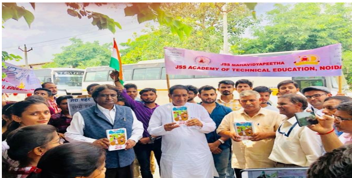
Awareness rally at village Kachera Warsabad, Dadri