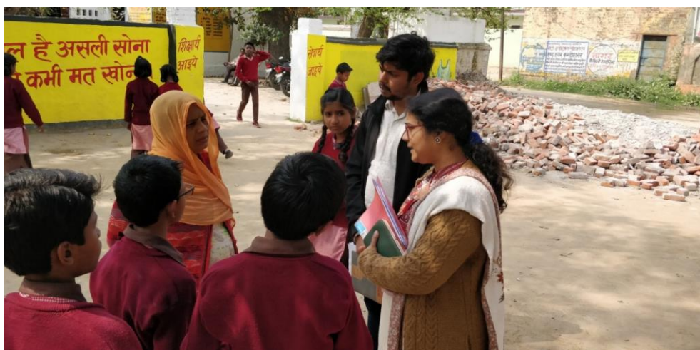
Awareness campaign on "Waste Management"

Ranoli Latifpur has 35% (1017) population engaged in either main or marginal works. 48% male and 21% female population are working population. 44% of total male population are main (full time) workers and 3% are marginal (part time) workers. For women 14% of total female population are men and 8% are marginal workers