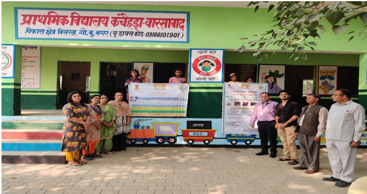
Visit to Kachera Wersabad by Swachh Bharat team of JSSATE, Noida